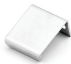
Satin Stainless Steel