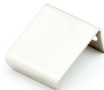
Satin Stainless Steel