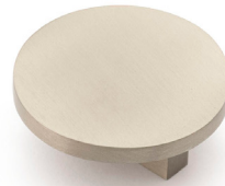
Dull Brushed Nickel