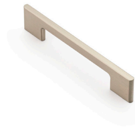
Dull Brushed Nickel