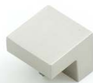
Dull Brushed Nickel