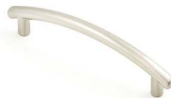
Dull Brushed Nickel